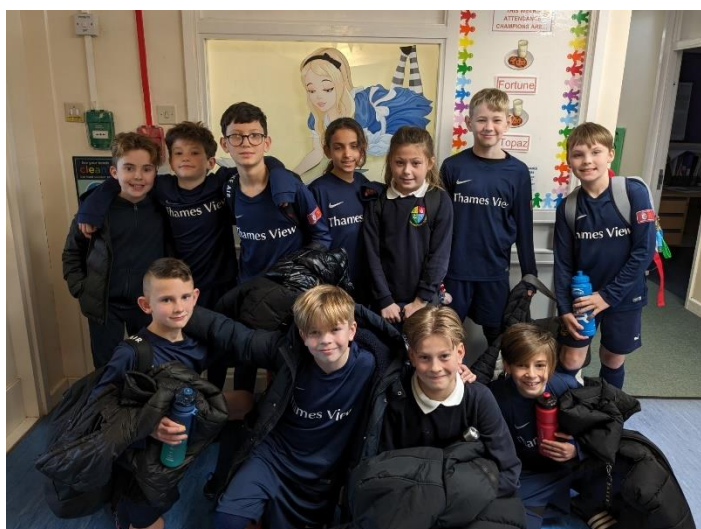
Thames View Primary Football Team

We'll done everyone for being part of the Thames View MYG Teams. We look forward to seeing more of you at events coming up this year