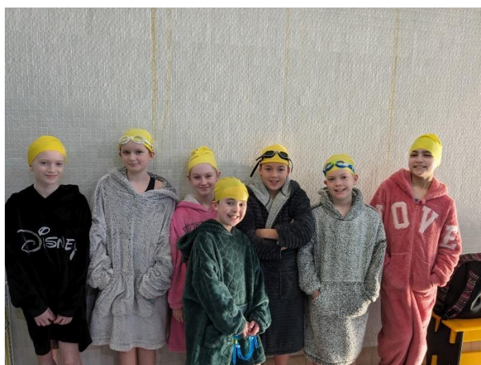
Mini Youth Games Swimming Team Friday 19 th January

We'll done everyone for being part of the Thames View MYG Teams. We look forward to seeing more of you at events coming up this year