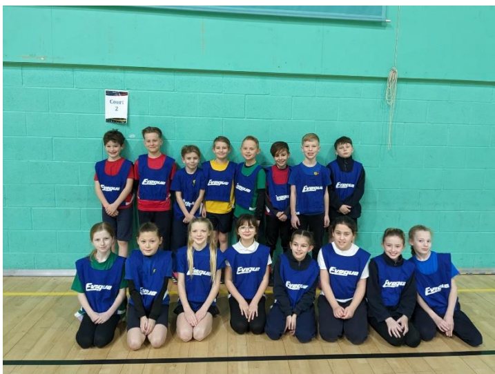
Mini Youth Games Athletics Team Thursday 25 th January