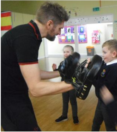
We practised our punching skills and learnt how to duck.