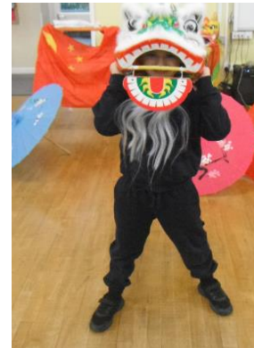
The Chinese Lion