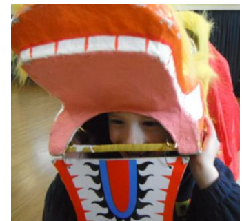
The Dragon in search of the Pearl of Wisdom