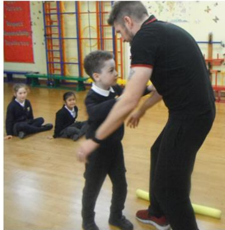
Blocker Chaser move