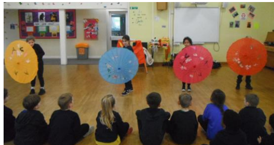
Practising with the parasols to carry the Pearl of Wisdom