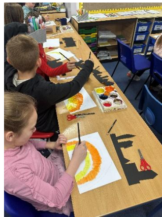
Year 6 – WWII

See our social media pages for further photos of our week