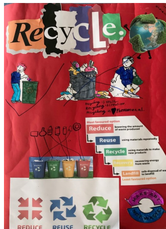
Lower KS2 Winner