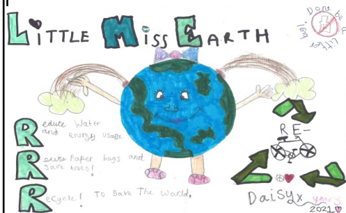
Lower KS2 Runners Up