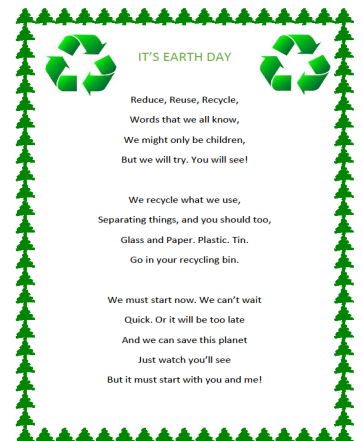
Upper KS2 Winner