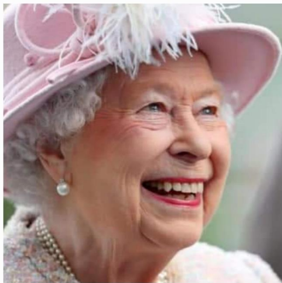
Queen Elizabeth II 1926 – 2022

We remember our Queen, and the kindness and commitment she showed to all.