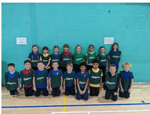
Year 3&4 - Primary School Games – Athletics