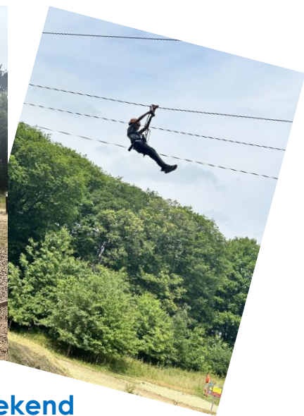
PGL – a few more memories from the Year 6 weekend away