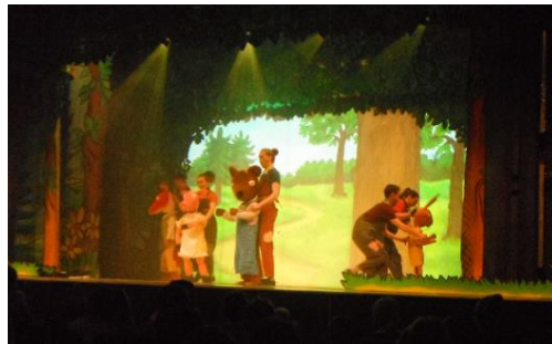
Year 2 theatre trip