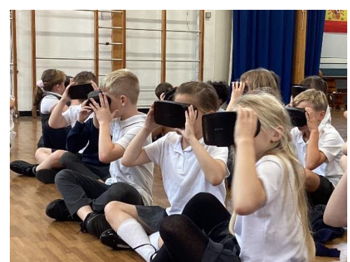
Year 5 : Egyptian VR workshop