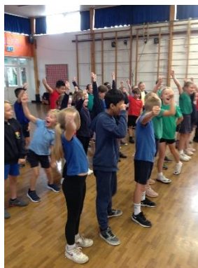
Year 6 WWI soldier workshop