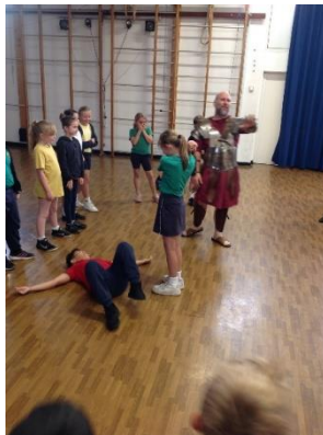
year 4 roman gladiator workshop